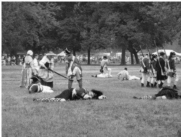
Women check the fallen at Vincennes.

Help sweep the field for cartridge papers, especially full ones. If you can not do it, encourage another member of your unit who has been watching the battle to come out and