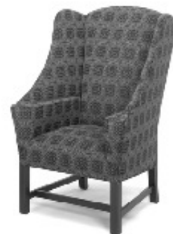
Upholstered furniture - formal and country, all made in the USA