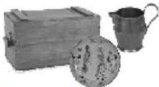
Accessories for home & camp