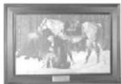
Print: Prayer at Valley Forge