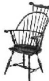
Windsor Chairs and Dining Tables

EAL Craftsman Directory for 16 consecutive years 1994 - 2009